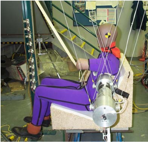
ISO TR9790 pendulum test on WorldSID