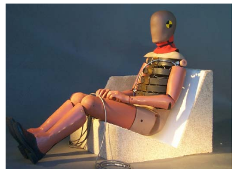
WorldSID prototype with jacket removed

Despite the difficulties of recent months, the final dummy is still expected to be released, "regulation ready", into the public domain on schedule in 2004.